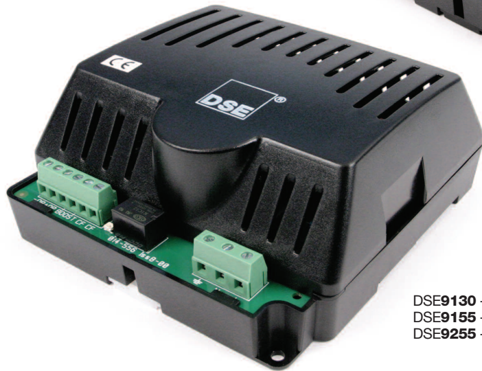
DSE9130 - 5 A 12 V DSE9155 - 2 A 30 V DSE9255 - 5 A 24 V