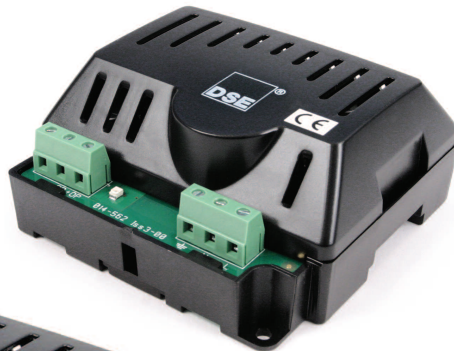
DSE9150 - 3 A 12 V