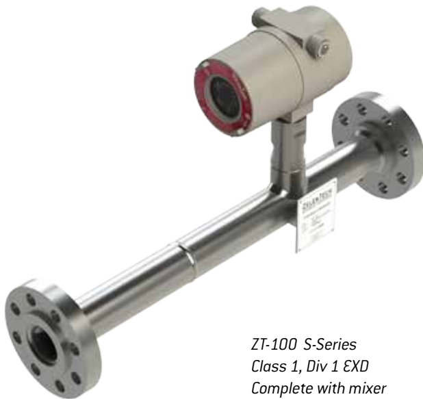
ZT-100 S-Series Class 1, Div 1 EXD Complete with mixer

Designed in accordance with standards such as API 8.2 and ISO 3171.