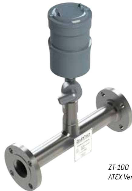
ZT-100 S-Series ATEX Version